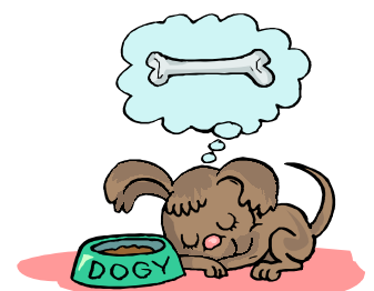
Home again ... dreaming of bones.