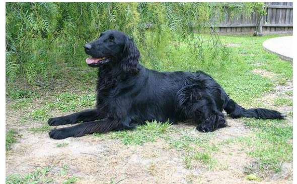
Zulu, the Flat Coated Retriever