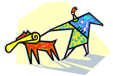
Reward your dog for walking on a loose lead

This all takes time but it will work depending on how motivated your dog is by food. You may find using a favourite toy more effective.