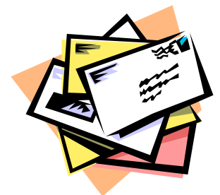
Anything in the mail?

Have faith in this letter. Do not break the chain. One owner broke the chain and got his own dog back.