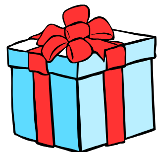
An apple for the teacher?