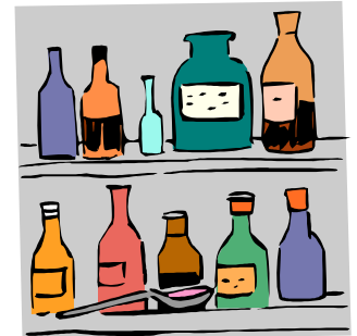
What is in your flea control product?

Flea control is far safer and easier than it was ten years ago. Take advantage of the new methods which are simple to use and highly effective. They will keep your Golden Retriever protected from fleas.