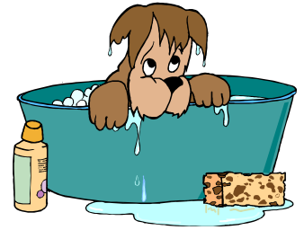
Bath time should be fun!

Dry him thoroughly so he doesn't get cold. Be especially diligent around the tail. Golden Retrievers can get a condition known as 'wet tail' if the tail is left damp. The tail hangs limply, is painful to touch or move and requires a day or so to recover.