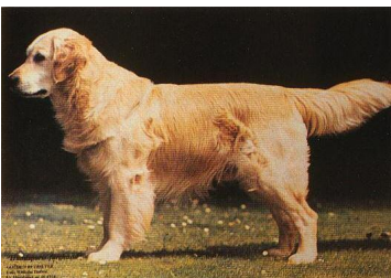
Ch Camrose Cabus Christopher